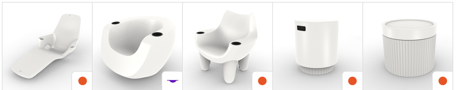
Shayz Lounger & Optional Risers